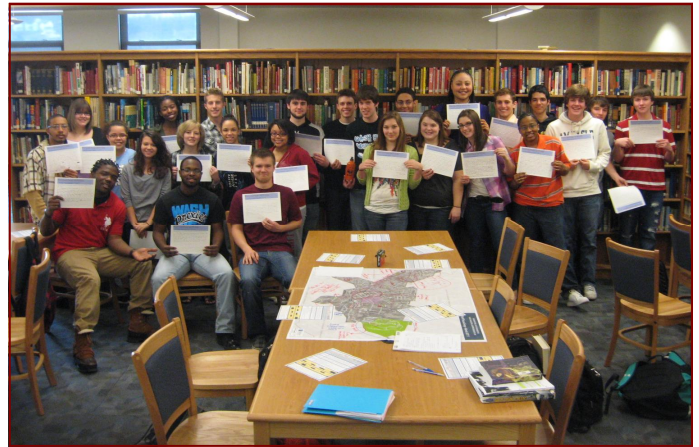
Students from the Washington High School Focus Group (Mackin, 2011)

The information collected from the students will be included as part of the Washington and East Washington Multi-Municipal Comprehensive Plan. The project, which began in November of 2010, is expected to be completed by the end of 2011.